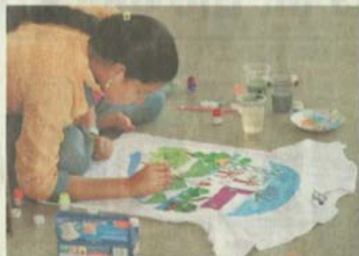
(Clockwise) Students perform at 'Chorea Night', the group dance competition segment of Spandan 2015, the inter-collegiate extravaganza of Jipmer in Puducherry; a student takes part in a T-shirt painting competition.