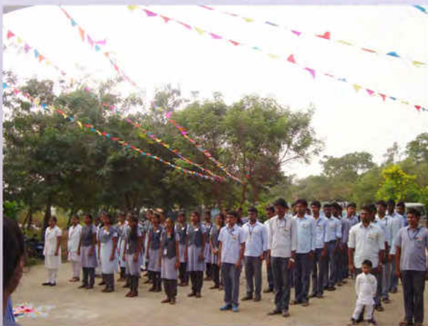
FLICKS FILM FESTIVAL - 2016