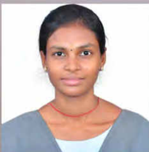
Punkuzhali B.Voc. Tourism & Service Industry