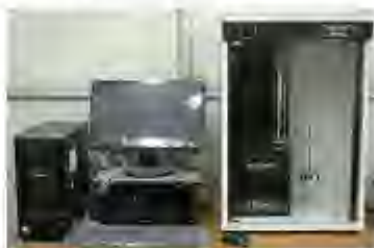
High Temperature Tubular Furnace-1800°C (Technico)