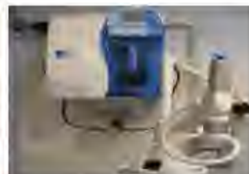
Water Purifier (Milli-Quest)