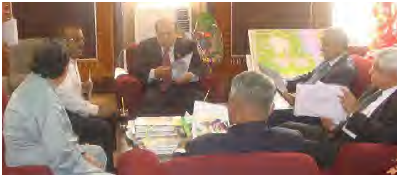
Vice-Chancellor and Director of Studies with Executives of Reserve Bank of India