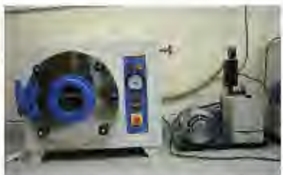
Vacuum oven with pump (Technico)