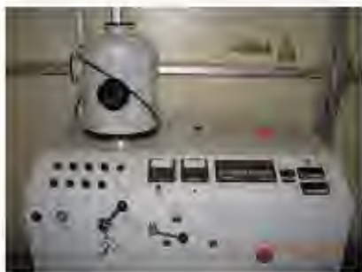
Electron Beam Deposition unit (Hindhivac)