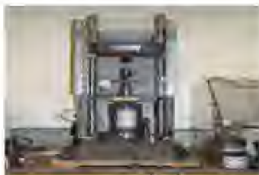
Hydraulic Press (Carver)