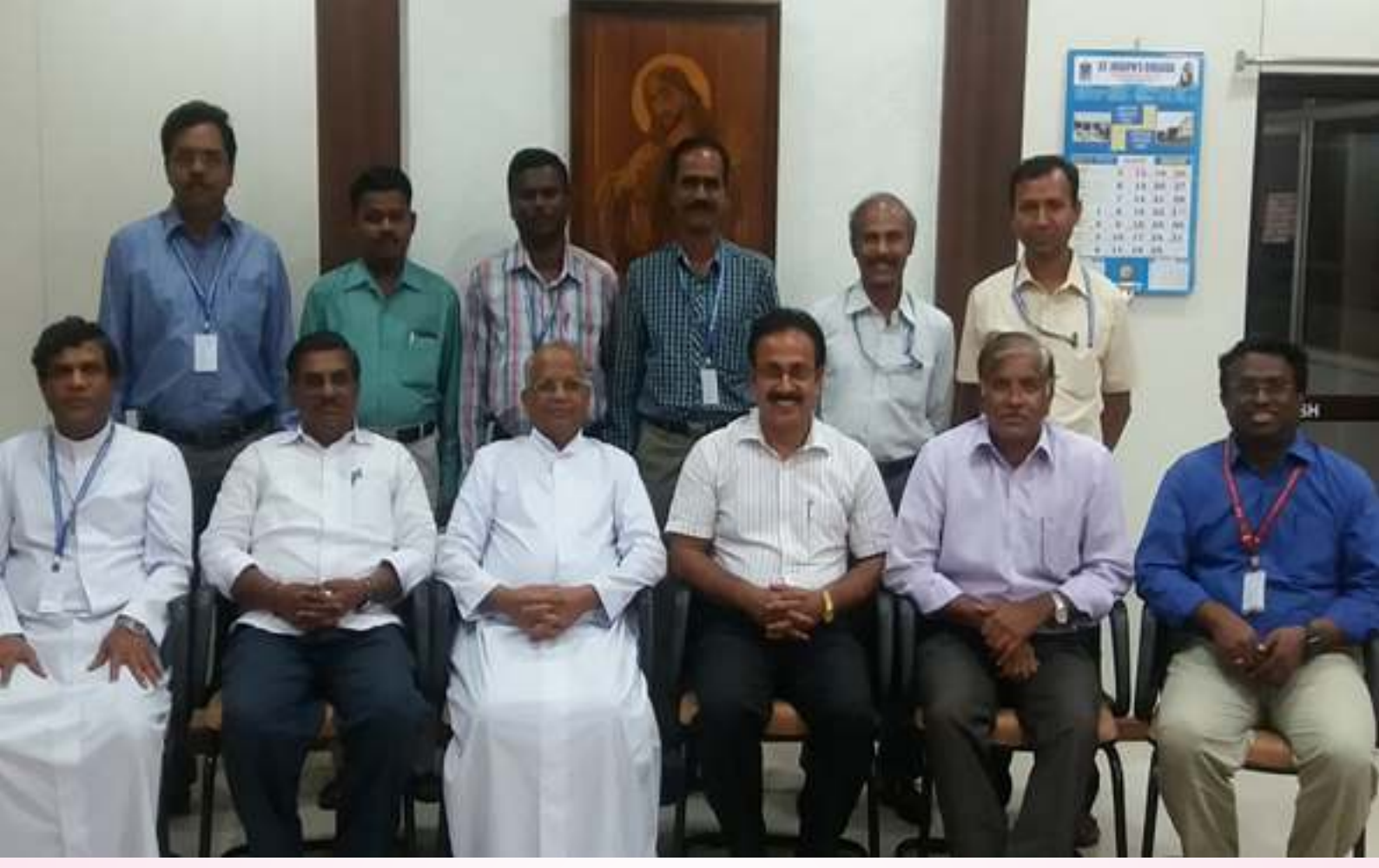
DDE of Pondicherry University Signed MoU with St. Joseph College, Trichy