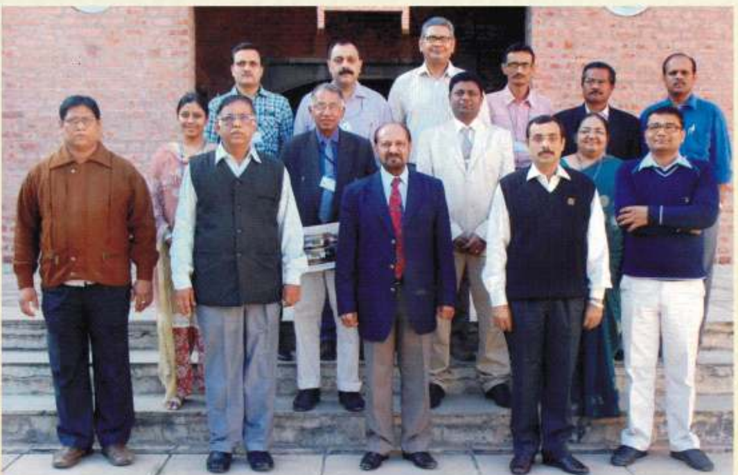
Participants of the recently concluded National Faculty Development Programme at Ahmedabad

Keeping this in view, the National Science & Technology Entrepreneurship Development Board (NSTEDB), Department of Science and Technology (DST), Government of India, took the initiative of introducing Entrepreneurship in the academic curricula of science & technology institutions. The most crucial change agents, in the process of developing young entrepreneurs are teachers specializing in teaching Entrepreneurship. Entrepreneurship Development Institute of India (EDI) , backed by over 30 years of experience in the field, designed a module to develop a cadre of trained teachers involved in teaching entrepreneurship at the schools and college levels and has been implementing Faculty Development Programmes successfully across the country and abroad. The Institute has been receiving enthusiastic response for this programme from the academic community. Till date, the Institute has organized more than 100 Faculty Development Programmes at national and international levels and in the process has groomed over 2100 teachers. EDI announces the next Faculty Development Programme in Entrepreneurship to be organised at Ahmedabad during December 16-27, 2013 .