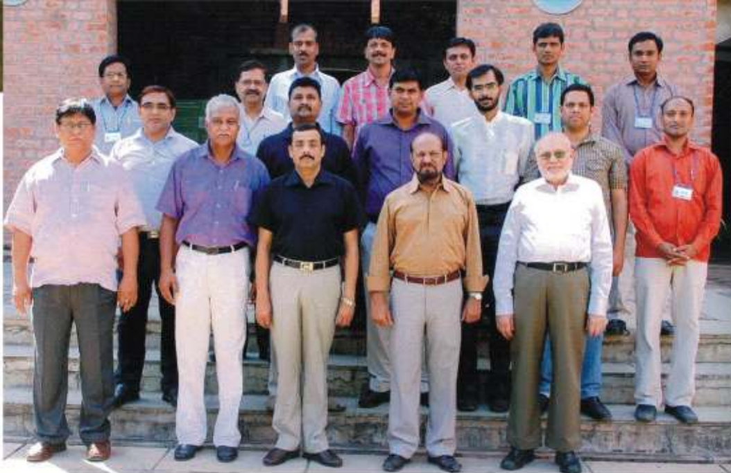
Under the aegis of the Education Department, Govt. of Gujarat, EDI organised Faculty Development Programme in Entrepreneurship for Professors of Engineering and Technical Colleges