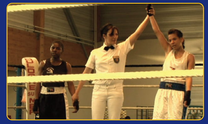
Boxing Maidens - France