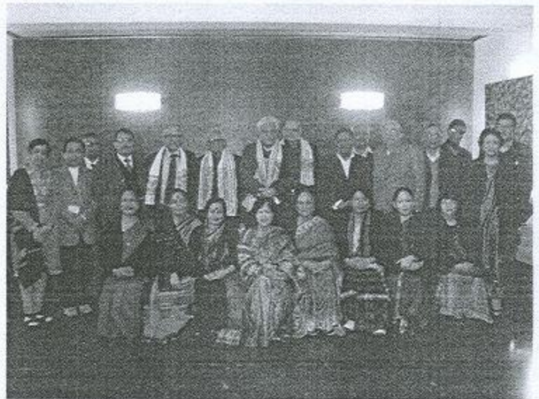
Group Photo of Diploma Award Ceremony

The first batch Award Ceremony has already been held in the month of December, 2012. Those who are virtually presenting and defending their work and declared successful will receive their Diploma by post.