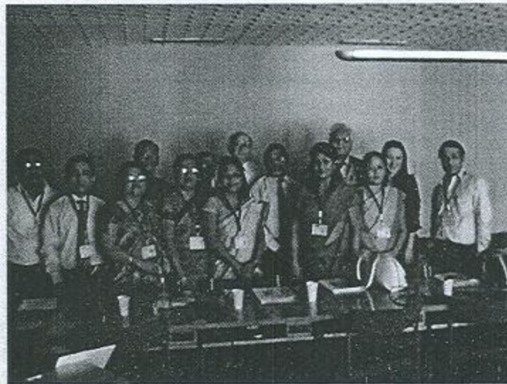
IDEL-HE Participants and Resource Persons at IIEP