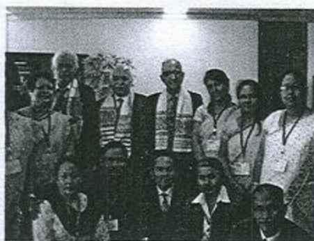
Valedictory Session at UNESCO, India office by Sh. Vinaysheel Oberoi, Permanent Representative of India to UNESCO